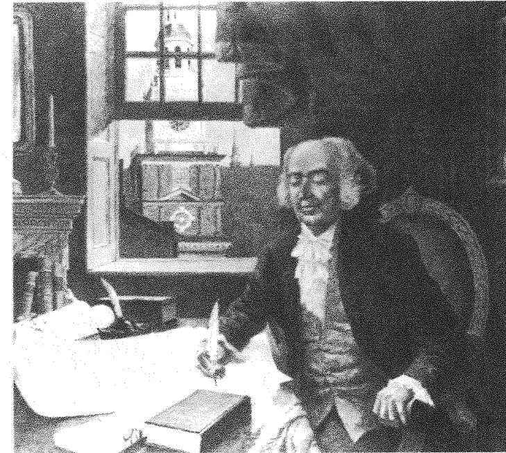
Fig. 1- This painting, the original of which is at the national Library of Medicine, depicts President John Adams signing the act for the relief of sick and disabled seamen on July 16; 1789