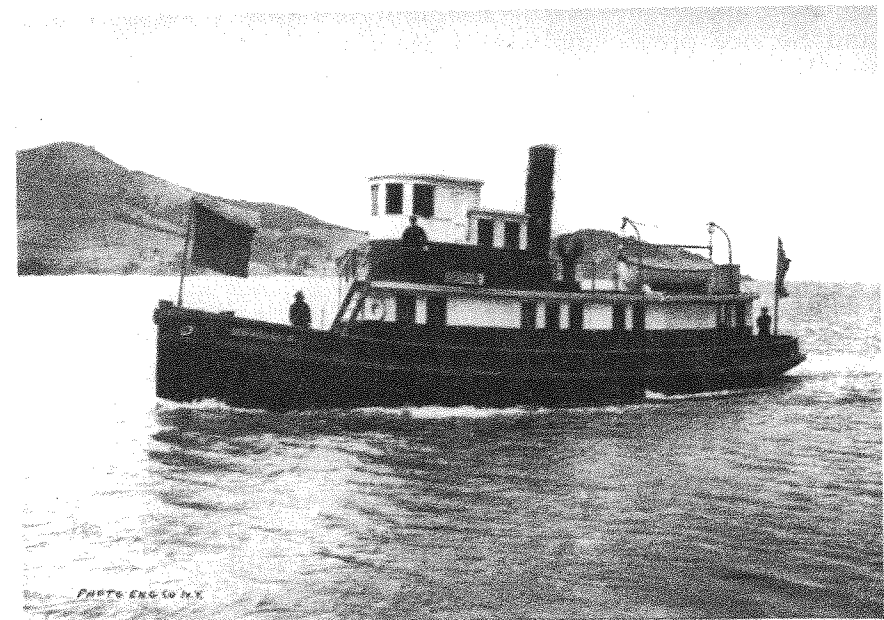
U. S. QUARANTINE STATION ANGEL ISLAND SAN FRANCISCO BAY CAL. BOARDING STEAMER GEO M STERNBERG.

The scope of activities of the Marine Hospital Service also began to expand well beyond the care of merchant seamen in the closing decades of the nineteenth century, beginning with the control of infectious disease. Responsibility for quarantine was originally a function of the states rather than the federal government, but an 1877 yellow fever epidemic that spread quickly from New Orleans up the Mississippi River served as a reminder that infectious diseases do not respect state borders. The epidemic resulted in the passage of the National Quarantine Act of 1878, which conferred quarantine authority on the Marine Hos-