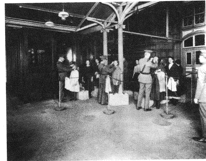
Fig. 5 - Public Health Service physicians examine arriving immigrants at Ellis Island for signs of trachoma, early 20th century.

Because of the broadening responsibilities of the Service, its name was changed in 1902 to the Public Health and Marine Hospital Service. The title of its leader was also shortened at that time from Supervising Surgeon General to Surgeon General.