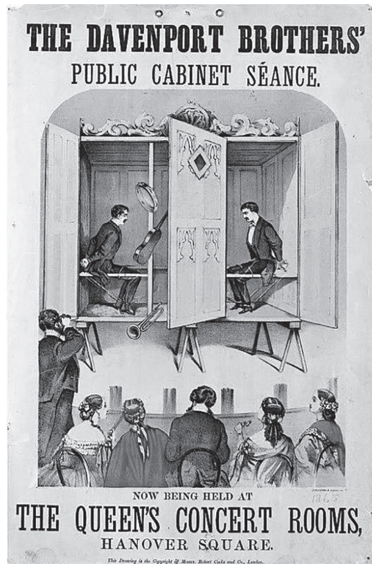
Fig. 5. The Davenport's box illusion with musical instruments.

(Fig. 5) These variegated performances promised materializations, levitations, communication with the afterlife, eerie vocal and instrumental music, photographs, dances and pictorial executions carried out by spirits or with their help, and so forth; all of which obviously involved the participation of a paying audience. Although it was considered “natural” that professionals in afterlife communication be decently paid, as was the case for lawyers, physicians, engineers etc., the competition with magicians and illusionists, who were just