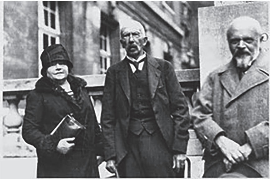
Fig. 1. Richet and Driesch at the Third International Congress of Psychical Research in Paris (1927).

the supernatural 3 . (Fig. 1) Oliver Lodge, William Crookes, Albert von Schrenck-Notzing, William James, Charles Richet, Pierre Janet, Arthur Conan Doyle and Alfred Binet, to name but a few of the most famous scientists in Europe, were among the physicians, physicists, chemists and, in particular, psychiatrists and psychologists who studied the paranormal. Italy was no exception, although widespread interest in spiritualism occurred relatively later (apparently as a result of the introduction of magnetic therapies, but mainly following the success of methods which arrived from overseas, especially from the United States, where – as we shall see – the world of the paranormal was approached and presented in a spectacular way). Cesare Lombroso and Enrico Morselli were the scholars who, scientifically, paid the highest price for their interest in the occult, as they were accused of having been far too compliant – after their initial doubt – in their transition from the methodo-