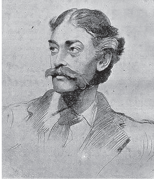
Fig. 4. Portrait of E. Gurney (1847 - 1888).

come a concert violinist. Biographers acknowledge that this would have been his path if he had not realized at a certain point that his skills in execution were scarce. He therefore limited himself to music theory and in 1880 he published a philosophical treatise on the aesthetics and psychology of music, entitled The Power of Sound , the intention of which was “to mark out clearly the position of music in relation to the faculties and the feelings of the individual, to the other arts and to society at large” 16 . Gurney was convinced that the power of music was so stimulating that “our corporeal life is brought before us in the most direct and striking manner, while at the same instant raised into a new region by its fusion with a quite incorporeal activity” 17 .