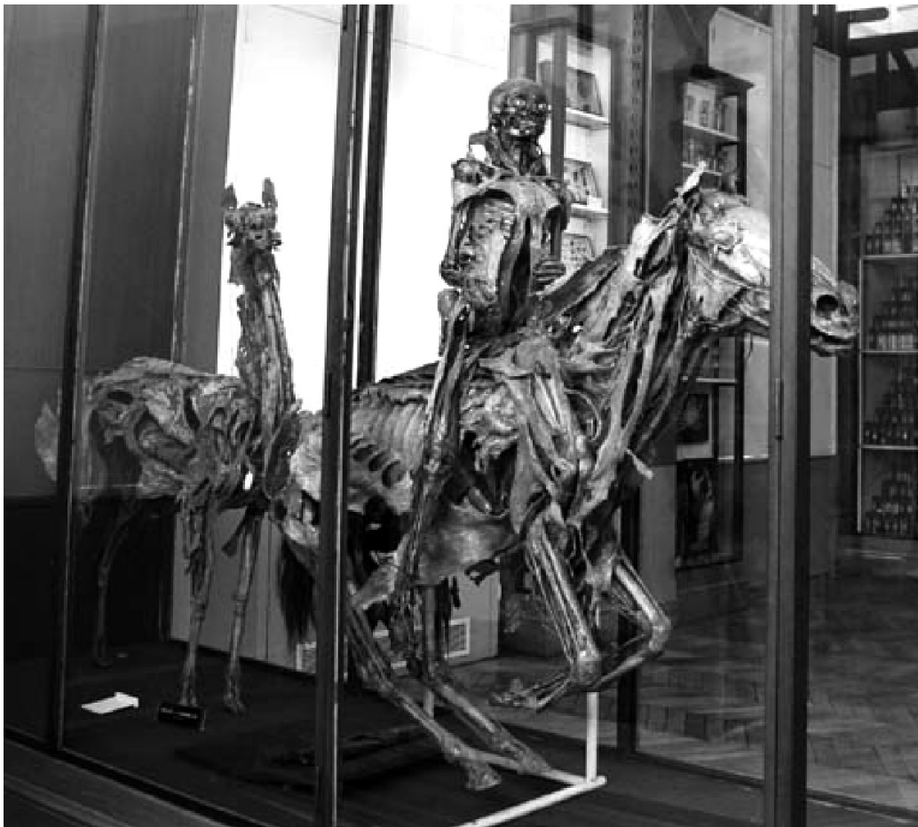
Fig.1 - The horse and rider by Fragonard. End of the eighteenth century. Musée de l'Ecole Vétérinaire de Maisons Alfort (MéVA).

Thus, the twenty dramatic surviving anatomical specimens prepared by Fragonard constitute a particularly important source of interest