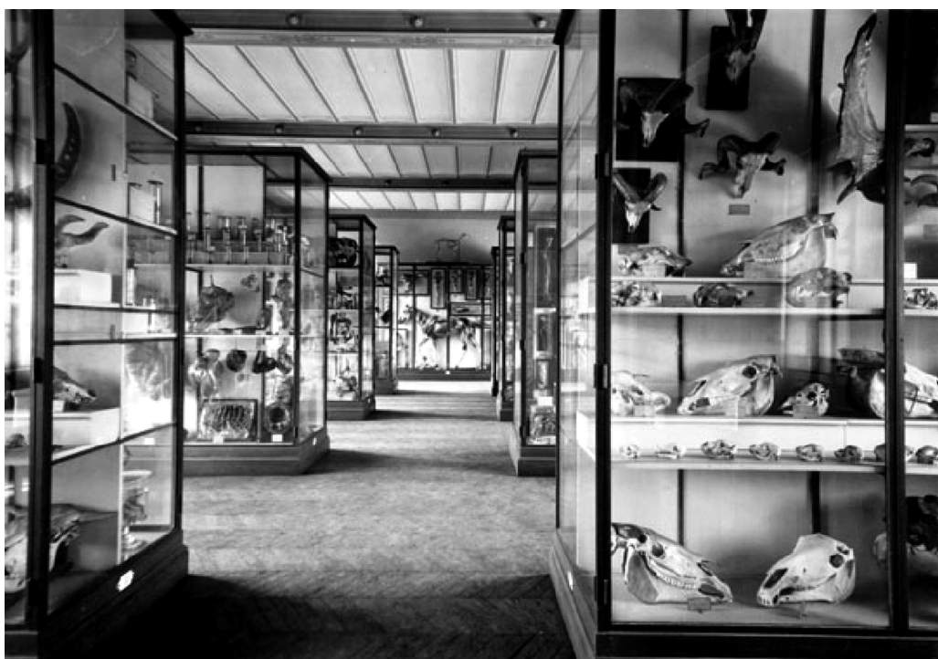
Fig. 3 - The museum as it was when it opened in 1902. Photograph from early twentieth century.

Opened in 1902, this new museum contained over 8200 objects, evidence of the continued collecting activity of the teachers at the veterinary school. While still not open to the public, the collection continued to serve a pedagogical function, being used every Thursday afternoon for lessons in comparative anatomy and pathology. Another important vocation of the collection, and one that resonated with its