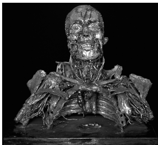
Fig. 4 - The Fragonard bust (from the Musée Fragonard) that appeared in the exhibition L'âme au corps held at the Grand Palais in Paris in 1993. MévA.

that were subject to change at short notice. Furthermore, because of its reliance on students, the Museum was closed for the whole of the summer, thereby missing out on a large potential public of foreign visitors to Paris during the peak holiday period. The neglect of the buildings meant that the conditions were far from ideal for preserving the collection, particularly, although not exclusively, the more sensitive biological material. Furthermore, Fragonard's eighteenth-century écorchés provided their own particular conservation problems. Thus, apart from the classic problems such as liquid preservatives leaking from jars, the wax in the Fragonard preparations would periodically start to melt as a result of sudden changes in temperature. It was clear, however, that renovating the building would be a very costly undertaking that was beyond the means of the veterinary school. Meanwhile, the collection, and particularly the Fragonard preparations were gaining in notoriety. The loan of a bust prepared by Fragonard (see fig. 4) to the large and successful 1993 exhibition, L'âme au corps held at the Grand Palais in Paris helped raised interest and the increase the number of visitors to Alfort 6 .