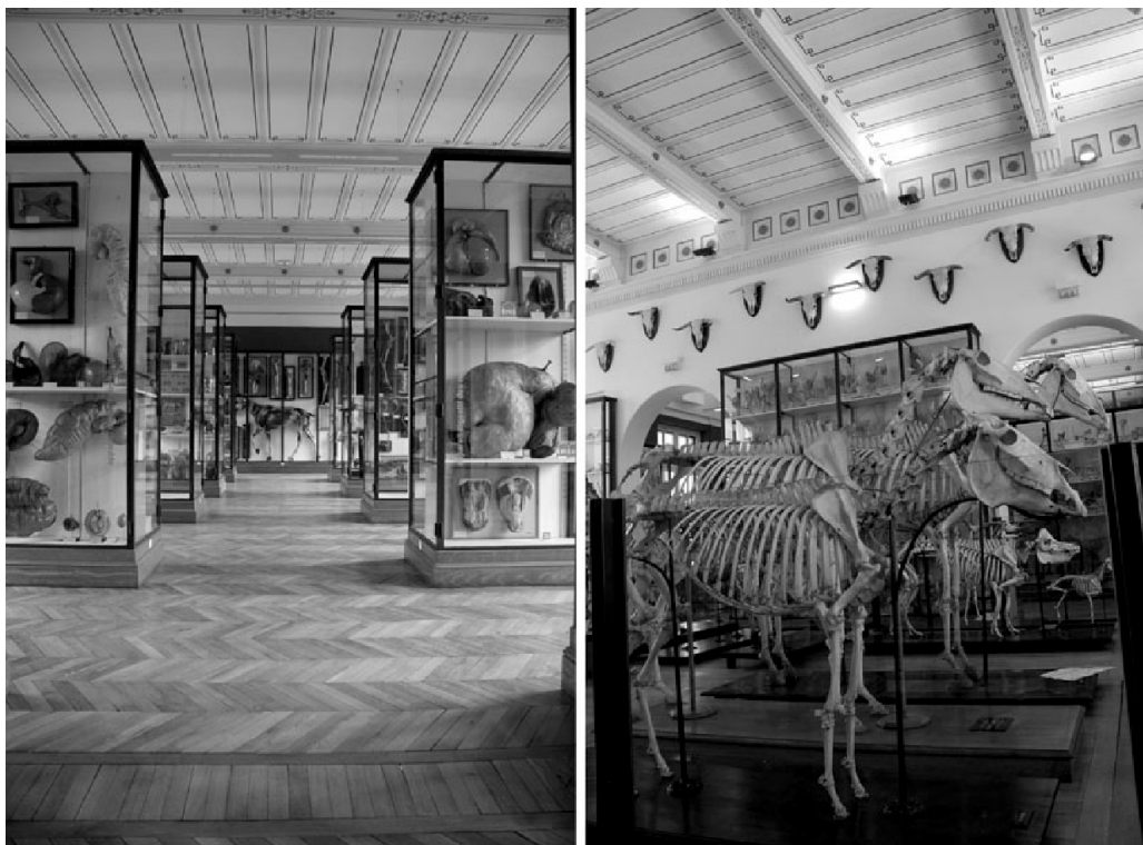
Fig. 5 - Two views of the renovated museum from 2008. M  vA.

go about this task. For science-oriented material there seem to be three possibilities, which, while not mutually exclusive, tend to be seen as such. So, at the risk of caricaturing the available choices, we can conceive the options in terms of three models for presenting a historical medical collection to the public. The first model is the ‘science center’ model, where the collection is put to work in a pedagogical framework with the aim of bringing science to the public. While these kinds of centers are usually dominated by installations intended to teach the fundamentals of the sciences, historical objects can also find their place in this scheme. Thus, they are often used to provide a historical introduction to a theme, with the specimens being presented in these terms. While such centers are becoming increasingly common, they are usually created de novo either using