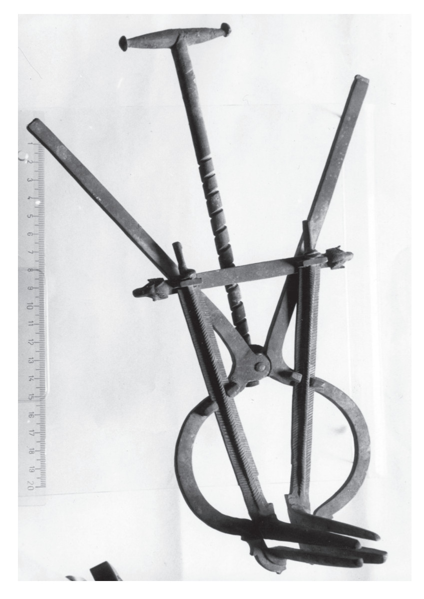
Fig. 2: Quadrivalve Uterine Speculum, Pompeii, Nat. Arch. Mus., Naples, L. 31 cm. Photo courtesy of the Römisch-Germanisches Zentralmuseum, Mainz L1037/1