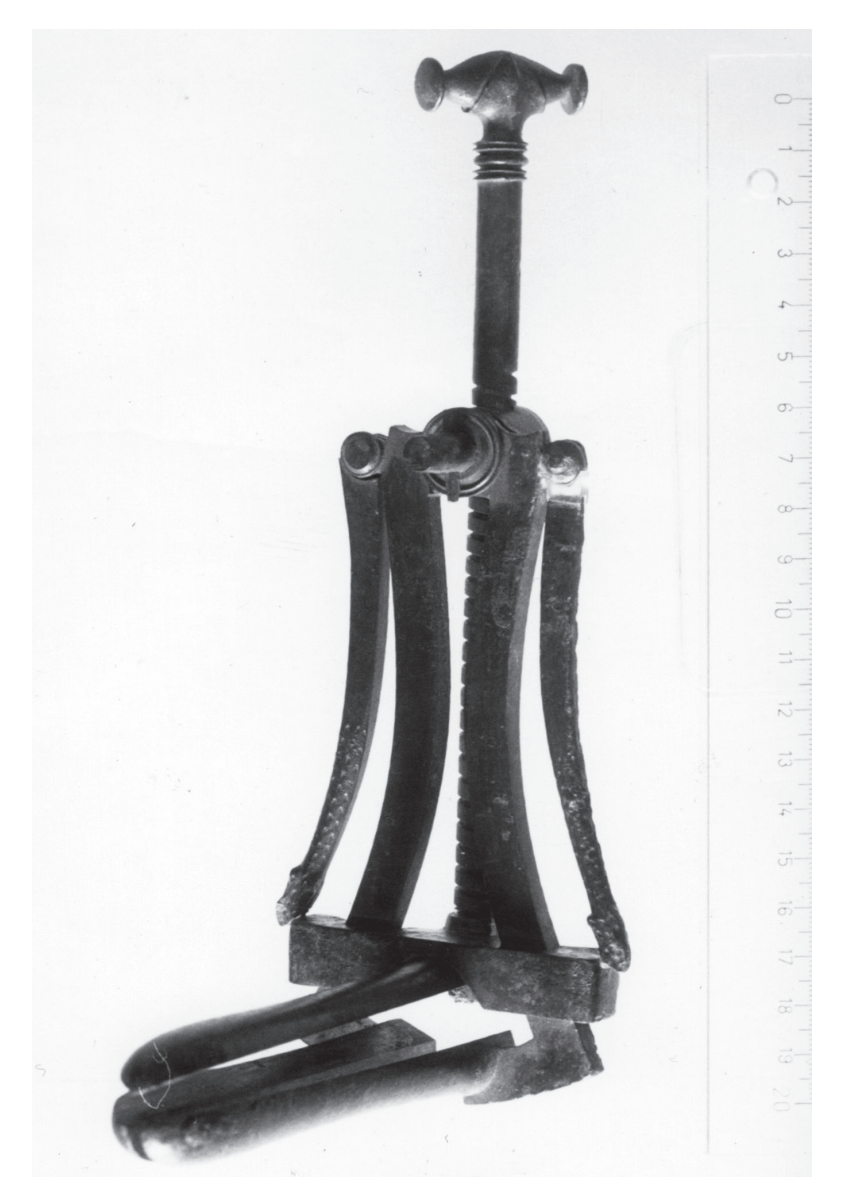
Fig. 1: Trivalve Uterine Speculum, Pompeii, Nat.Arch. Mus., Naples, L. 20.5 cm. L1038/7