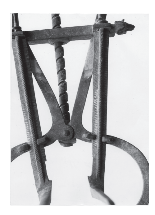
Fig. 3: Quadrivalve Uterine Speculum, Pompeii, Detail. L1042/10