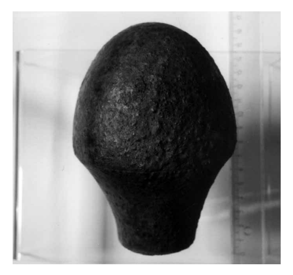
Fig. 1 - Bleeding Cup from Thebes, National Museum, Athens (Inv. no. L 349a).

Nature of Woman, Excision of the Embryo , and Diseases of Women are the primary witnesses, whereas we have to go mainly to Celsus' De Medicina for the third through the first centuries BCE<sup>5</sup>. Although Celsus wrote his treatise under the emperor Tiberius, many of the interventions and instruments he describes were likely developed much earlier. Those relevant to this essay will be noted as we go along. As we have broached the subject of the bleeding cup, called sikya in Greek and cucurbita in Latin, we may as well begin with cupping<sup>6</sup>.