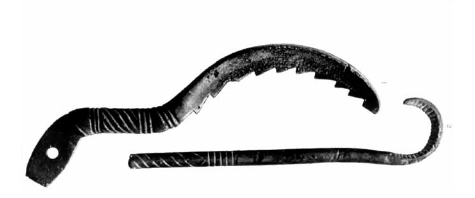
Fig. 8 - Cranioclast and retractor (serving either as embryo or lithotomy hook or both) from Meyer-Steining Collection. The former is now missing.

It is uncertain what the other names designated. The spathion was clearly equated with the polypikon spathion on occasion; so it too may merely have been a lancet<sup>41</sup>. In the case of the hemispathion , or "half spatula," its name suggests a common scalpel of the bellied or breast shaped type with which we are familiar. An argument can be advanced that in some instances the syringotomon was also a common scalpel but with a straight blade<sup>42</sup>. Whatever form these cutting instruments assumed, all were employed for interventions in the genital orifices of the female body; therefore, they had to be suitable for work in confined places where care had to be taken not to cut or puncture anything but the targeted tissue. In contrast, knives are not brought to bear in Hippocratic gynecology except in the case of difficult births. It is to these and the instruments used in their connection that we now turn.