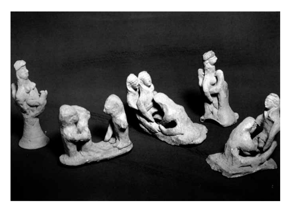
Fig. 4 - Archaic Votives, Lapithos, Cyprus.

to the testimony of Antyllus just referenced, Soranus treats its role extensively in the birthing process ( Gyn. 2.68). He envisages a chair having a firm back, a crescent shaped seat, open in front, on which the gravida sits, and handles for her to grip during contractions. Such a chair is depicted in the well-known terracotta relief from the tomb of the midwife Scribonia Attike at Ostia<sup>10</sup>. Interestingly, the midwife seems to look away from the genitalia of the gravida, exactly as Soranus directs (Fig. 3).