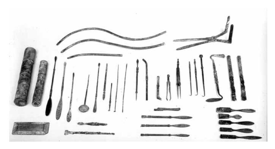
Fig. 7 - Surgical Instrumentarium from Italy.

other birthing hooks were extracted from the House of Pumponius Magonianus and the Casa del Medico Nuovo I. Thus were established three locations in Pompeii where gynecology was practiced as a specialty in 79 ACE<sup>19</sup>.