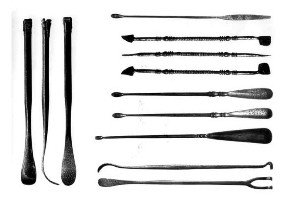
Fig. 9 - L. to R. Spatula, lancet-cautery, two spoon-probes (one with roughened interior), a lithotomy hook and (bottom) a combination lithotomy hook and knife.

survive. To illustrate its features we may once again have recourse to the Naples Museum for a specimen from Pompeii in (Fig. 5, middle row, 4<sup>th</sup> from left)<sup>53</sup>.