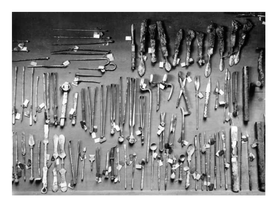
Fig. 6 - Assortment of Surgical Instruments from the Vesuvian Cities in the Naples Museum. Photo by Alinari, late 19<sup>th</sup> century.

on the tools of the trade. One thinks in this connection of the second century satirist Lucian who disparaged surgeons attempting to conceal their incompetence with fancy equipment ( Ind. 29).