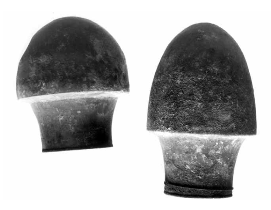
Fig. 2 - Bleeding Cups from Pompeii (Naples Mus. Inv. nos. 77989, 77998).

This operation was of course commonplace in Greco-Roman medicine. In contrast to the pre-Roman cup shown in Fig. 1, their Imperial counterparts feature a more angular profile at the shoulder as, for example, two specimens from Pompeii (Fig. 2).