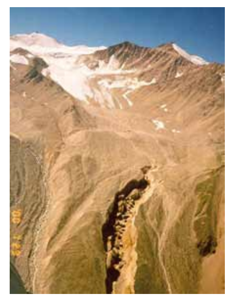
Fig 3 - Debris flow initiation zone at the marginal moraine of Kyaarty glacier, 2000

tain region of the Central Caucasus. Available data were collected and systematized by authors (SEINOVA & TATYAN, 1977; ANDREEV & SEINOVA, 1984; SEINOVA & ZOLOTAREV, 2001). Our observations were carried out in the upper stream of the Baksan River basin and in its major tributaries Chegem and Cherek, with a total area of 2100 km<sup>2</sup>, including 112 debris flow basins. The tributaries of the main river collect their waters on the north slope of the Main Caucasus Range with maximum elevations over 5000 m. The glaciers cover an area of 550 km<sup>2</sup>. The 75 tributaries with the highest debris flow hazard originate from glaciers. The Baksan River originates from glaciers of the highest mountain of Caucasus, the Elbrus volcano (5,642 m) and flows into the Terek River, which runs into the Caspian Sea.