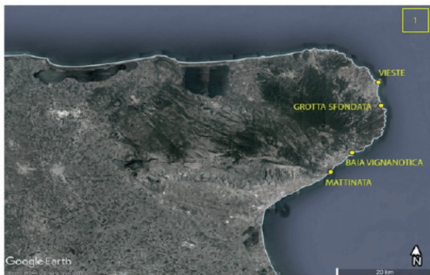
Fig. 2 - Gargano, Northern Apulia: detail of the study sites

The studied coastal sector of Gargano Promontory (Fig. 2), in northern Apulia, is highly variable in terms of geology.