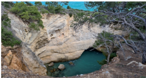
Fig. 5 - Grotta Sfondata (Vieste, Gargano). Limestone cliff affected by karst processes leading to collapse sinkhole

existing bedding planes and the structural features in the rock mass. Locally, there are also many sites where the effects of karst strongly interact in producing peculiar morphologies, such as at Grotta Sfondata (Fig. 5), with the collapse of the vault above marine and karst caves, through sinkhole processes (GUTIERREZ et alii , 2014; PARISE, 2019, 2022).