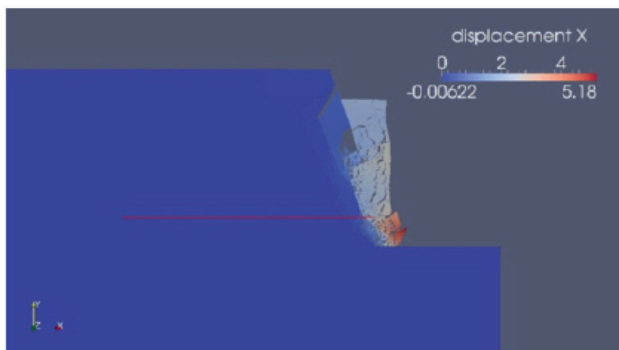
Fig. 10 - Numerical results of a FEMDEM ideal model of the Melendugno cliffs

These studies have been developed by means of either finite element method or more advanced hybrid finite/discrete element techniques and highlight the different role of toe erosion and rock weathering, as well as the structural control due to joints and faults in conditioning the failure process. As an example, Fig. 10 shows the results of the application of the finite/discrete element technique (FEMDEM, MUNJIZA 2004) to an ideal cliff representative of the Melendugno coastal stretch: it clearly indicates a brittle failure mechanism of the cliff as a consequence of a slightly inclined joint structural control, combined with sea erosion at the toe.