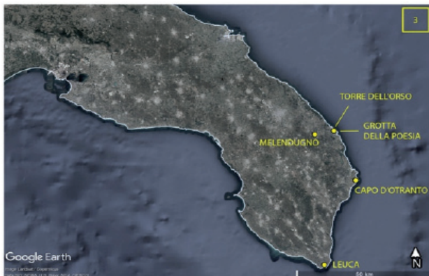
Fig. 8 - Salento, south Apulia: detail of the study site

On the Adriatic side of Salento Peninsula, the main typical cliffs are made by soft to very soft rocks, in particular Plio-Pleistocene calcisiltites and calcarenites, leaving space to outcrops of Cretaceous-Oligocene limestones along the southernmost coastal sector, from Capo d'Otranto to Leuca (Fig. 8).