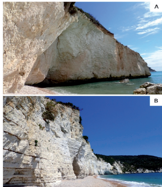
Fig. 4 - Limestone cliffs in the Gargano Promontory: A) massive limestone; B) limestones with flint layers and nodules