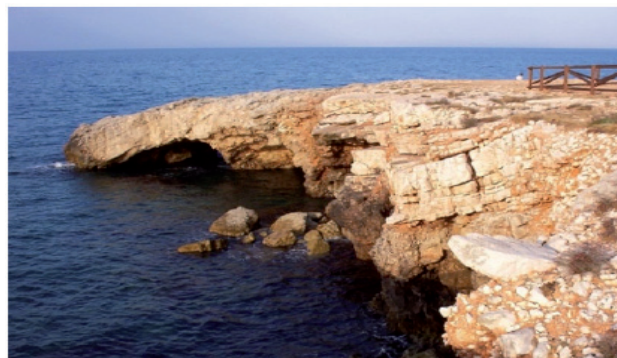
Fig. 7 - Planar failures along bedding planes in the proximity of "Grotta Chiar di luna" cave (northern coastal stretch of Polignano a Mare)

On the other hand, falls of overhanging blocks due to undercutting of the cliffs and cave breakdown affect the whole coastal cliff of Polignano a Mare, involving both the limestone beds and the calcarenite succession.