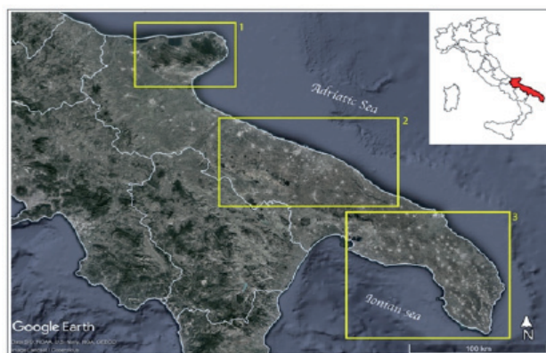
Fig. 1 - Study site locations. Yellow rectangles represent the three considered areas: 1. Gargano Promontory, to the north, 2. Murge Plateau, central sector, and 3. Salento Peninsula, to the south

Sloping coasts (flat or convex) are the most common morphological type in the region (MASTRONUZZI et alii , 2004). Low sloping rocky coasts are made by plain sloping cut through Plio-Pleistocene calcareous sandstone; convex rocky coasts are slopes shaped on limestones partly submerged by sea; cliffs are widespread on coastal portions, made by calcareous sandstones, clays and highly karstified limestones (MASTRONUZZI & SANSÒ, 2006; PARISE, 2008).