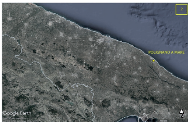
Fig. 6 - Murge, central Apulia: detail of the study site

There, and in the surrounding areas, many instability phenomena have occurred in the past, also with waves higher than 5 m, mostly coming from the ENE (Regione Puglia, 2007),