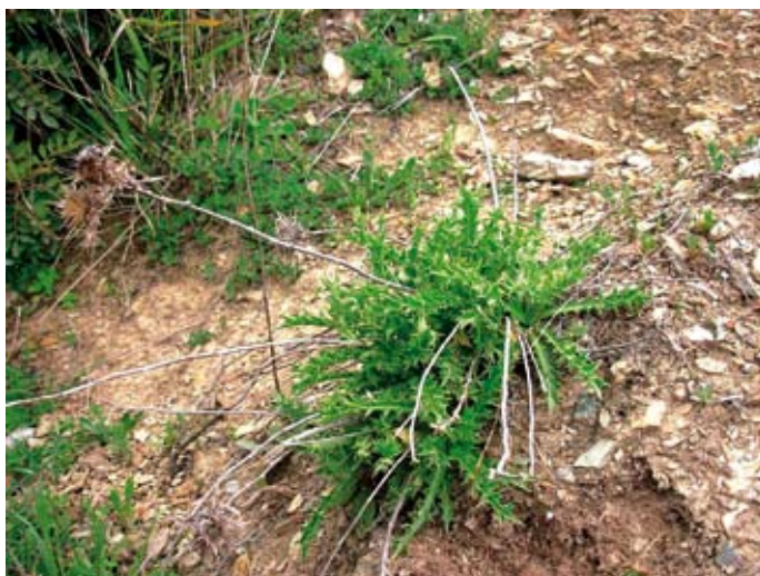
Figs 7-8 – Habitat of Trichoferus arenbergeri : mountain slopes (Orgosolo, Arcu Correboi) with Santolina corsica (7), stony ground with Carlina corymbosa (Nebida, Punta Mezzodi) (8).

of the host plant or in the soil near it, as in Plagionotus floralis (Pallas, 1773) (Cherepanov 1990; Biscaccianti 2004), since no trace of the initial stages of larval activity has been observed in the stems or other exposed parts of the plant.