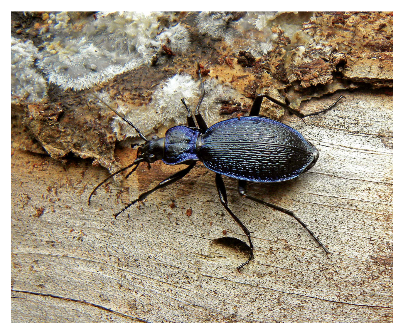
Fig. 2 – A ♀ of Carabus ( Chaetocarabus ) lefebvrei bayardi (Sila National Park, Sbanditi-Fossiata, November 20<sup>th</sup>, 2011; photo by Antonio Mazzei).

Ground beetles were collected in 2013 during their entire activity season, from April to October, with pitfall-traps emptied every 20 days, to obtain a conspicuous "year sample". In each sampling site a number of 7 or 8 traps were set up to compensate trampling by cows or running waters and to ensure at least 5 undamaged traps per time. Traps were given by plastic vessels with an upper diameter of 9.2 cm and a depth of 11 cm and provided with a small hole to avoid water filling and "aquaplaning" of beetles. Traps were filled up to two thirds of their depth with a commercial wine vinegar saturated by sodium chloride as further preservation measure and buried at least 10 meters from each other on a straight line. Wine vinegar is known to attract preferentially some larger Carabinae or the Sphodrines, such as Calathus spp. but not phytophagous carabids (Amara, Harpalus). Nevertheless, vinegar has been