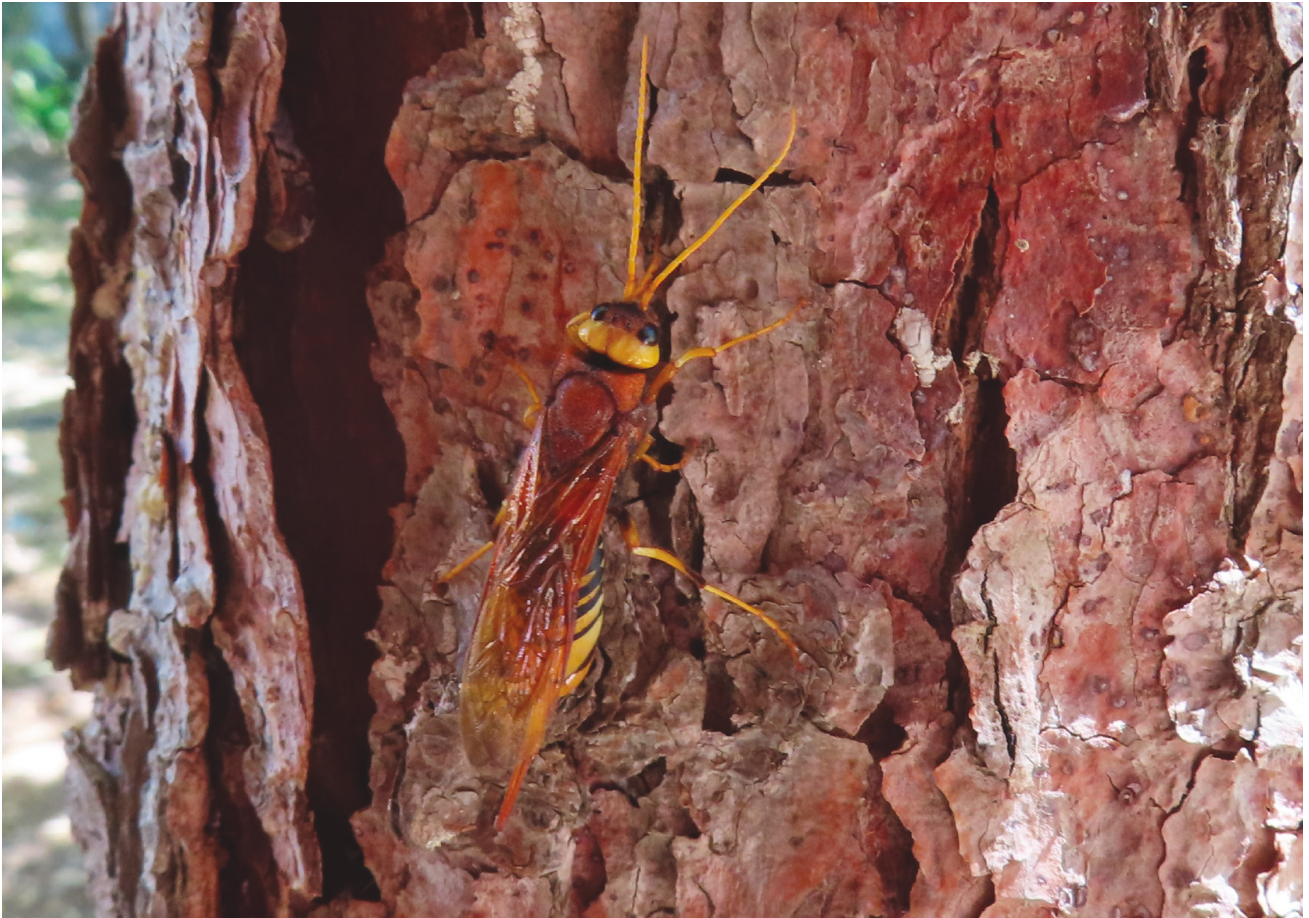
Fig. 2 – Urocerus augur , female, from Balchik, Photo: N. Petkova.