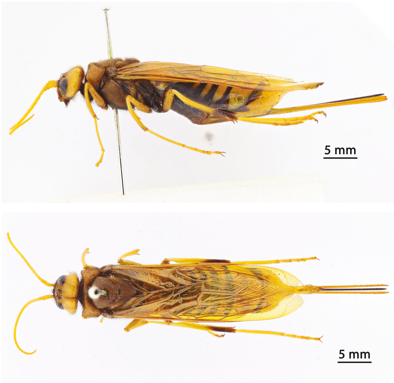
Fig. 3 – Urocerus augur , female, lateral view (a) and dorsal view (b), from Varna, Photo: M. Mohammed.

resh, 2♀♀ (NMNHS); 15-30 Jul 1922, leg. I. Buresh, 3♀♀ (NMNHS); 25-30 Jul 1922, leg. I. Buresh, 1♀ (NMNHS); 1-10 Aug 1922, leg. I. Buresh, 1♀ (NMNHS); 1 Aug 1923, leg. I. Buresh, 2♀♀ (NMNHS); 2 Aug 1923, leg. I. Buresh, 1♀ (NMNHS); 20 Aug 1923, leg. P. Drenski, 1♀ (NMNHS); 8 Aug 1925, leg. I. Buresh, 1♀ (NMNHS); 26 Jul 1926, leg. I. Buresh, 1♀ (NMNHS); 25 Aug 1926, leg. P. Drenski, 4♀♀ (NMNHS); 7 Sep 1926, leg. P. Drenski, 1♀ (NMNHS); 16 Aug 1927, leg. I. Buresh, 1♀ (NMNHS); 27 Aug 1927, leg. I. Buresh, 1♀ (NMNHS); 25 Jun 1931 leg. P. Drenski, 2♀♀ (NMNHS); Jul 1932, leg. I. Buresh, 1♀ (NMNHS); 30 Aug 1932, leg. S. Kantardzhieva, 1♀ (NMNHS); Aug 1932, leg.