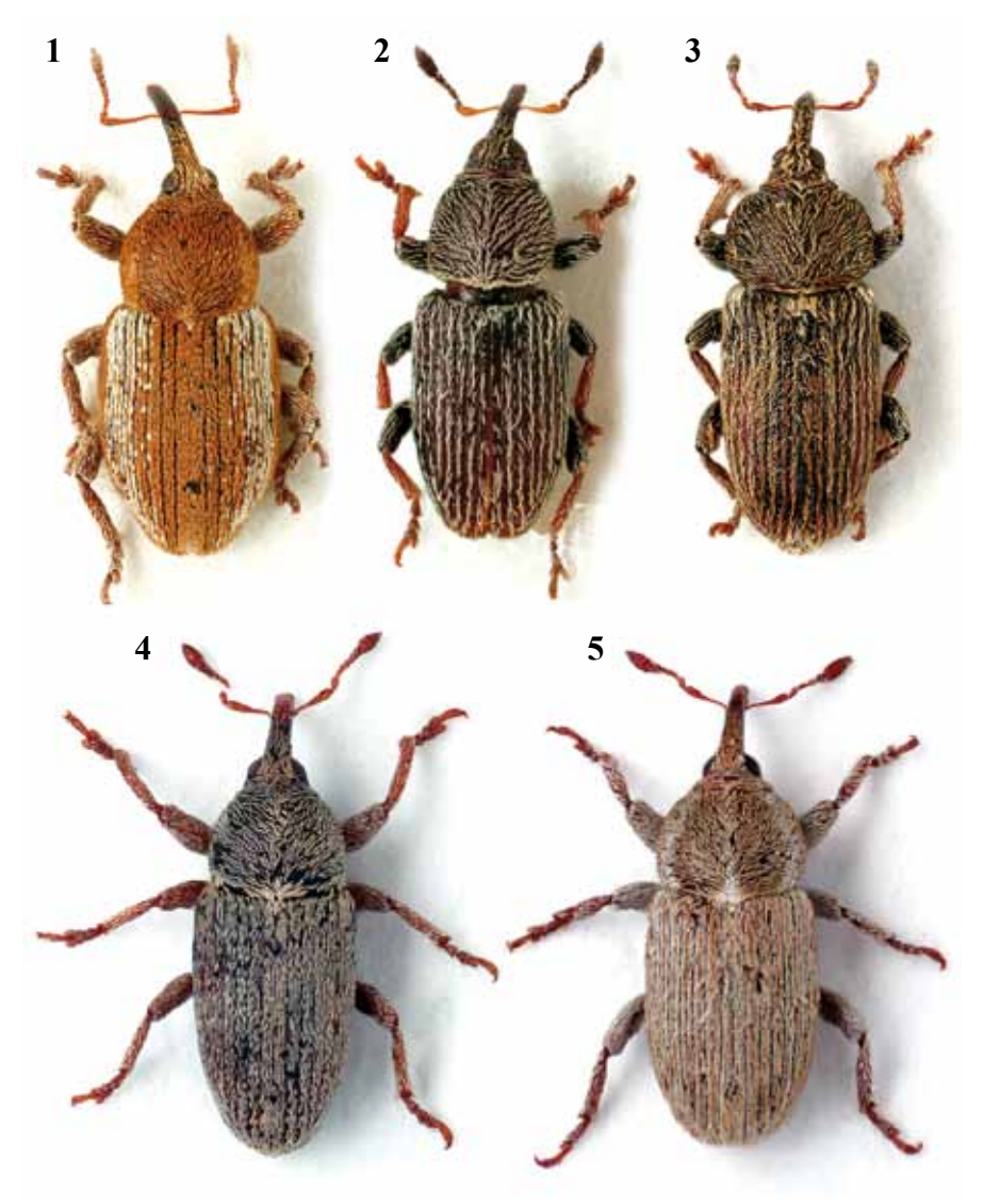
Figs. 1-5 – Habitus of . Tychius podlussanyi female paratype (1); T. weilli female paratype (2); T. magnithorax male paratype (3); T. ucrainicus holotype (4); T. zagrosianus female paratype (5);. Not at the same scale.

REMARKS. This species belongs to the T. parallelus group (Caldara 1990), and is closely related to T. hispanus Velazquez & Caldara, 1989, from which it differs distinctly in the shape of the rostrum which is longer, especially in the female, in lateral view more regularly and less mark-