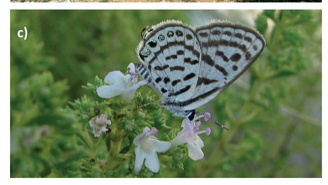
Fig. 2 – a), Rocky habitat of Tarucus balkanicus at the Donje Sitno locality; b), Ruderal habitat at the locality Čavoglave, near the spring of Čikola river; c), T. balkanicus feeding on Satureja sp.

Iolana iolas (Ochsenheimer, 1816) and Pyronia cecilia (Vallantin, 1894) occur (Withrington & Verovnik 2008). However, some parts of the island, such as the Kamenjak area where we found T. balkanicus, are more difficult to access and possibly remained unstudied during previous surveys. The location is accessible only by a partially abandoned footpath and is mostly overgrown with bushes, with only small remnants of open grasslands among stone walls. Additional surveys of the other remote parts of the island could yield additional finds of this species.