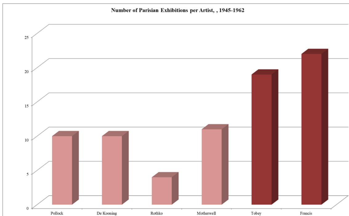
Chart 3: Number of Parisian Exhibitions per Artist, 1945-1962 Based on data collected by the author as part of the Artl@s project ( https://artlas.huma-num.fr )