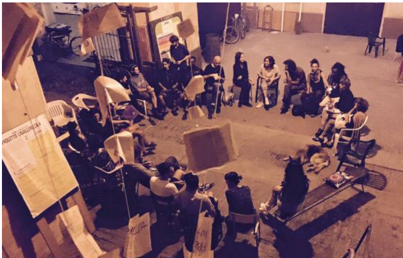
Fig 5. An assembly.

The movement’s main goal has always been to build a ‘Cavallerizza for everybody’, a public and open common. As a way to reach this objective ‘here and now’ all kinds of events have been organized: political meetings (not only related to the Cavallerizza itself), parties, public debates, workshops, courses, guided tours, calls to clean up the space, but also artistic events, such as concerts, performances, exhibitions. Artists have been present from the very beginning of the occupation in the highly heterogeneous group of squatters.