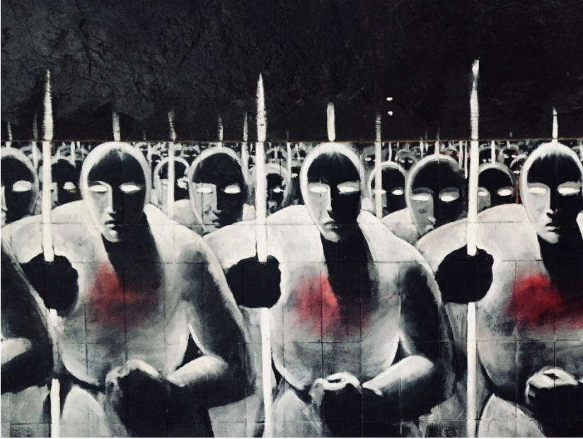
Fig 3. Stefania Fabrizi, I guerrieri della luce, 2013 – MAAM, Roma

Thanks to the works and its original way of 'doing art', MAAM has today achieved strong national and international media attention. The keyword 'MAAM Roma' brings up 136,000 results on Google. Newspapers such as The Guardian , and specialized magazines such as Artribune and InsideArt have featured articles on Metropoliz and its museum. In addition to the 'media legitimation' of MAAM and Metropoliz, an implicit 'institutional legitimation' has also been established by some institutional museums such as the Pistoletto Foundation and the Museum of Contemporary Art of Rivoli, who also donated and loaned some artworks to MAAM. Another crucial stepping stone in the process of legitimation of Metropoliz through art was the visit of Luca Bergamo, the current Councillor for Culture and Deputy Mayor of the city of Rome; he defined MAAM «as a model to preserve» 3 . More recently, De Finis was called upon to rethink and direct MACRO, the Museum of Contemporary Art of Rome. According to De Finis, this is potentially a big victory for Metropoliz, the MAAM and the legitimation of both, but «it will also be a big challenge to get two pirate ships to sail together».