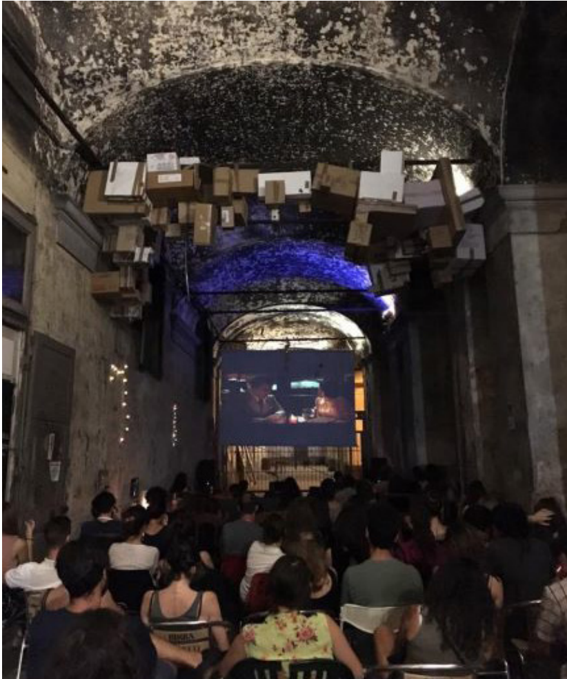
Fig 7. A cinema night

speak to a small part of the population.