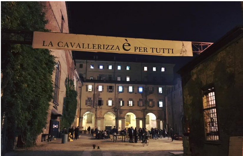
Fig 4. «Cavallerizza is for everybody» at the squat's entrance

Cavallerizza Reale is a building complex located in the city centre of Turin. Its construction started in the Baroque Age as a part of the Savoia's Zona di Comando and is as such part of the UNESCO world heritage site 'Residenze Sabaude'.