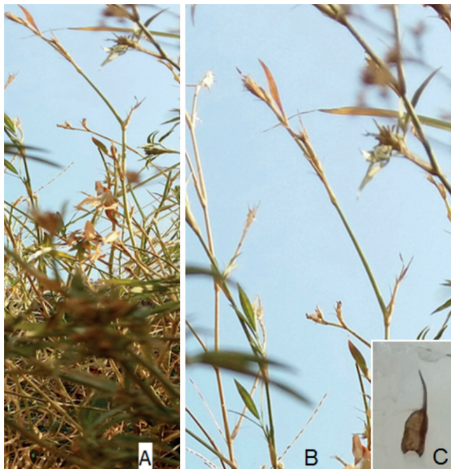
Figure 1. Stylosanthes calcicola Small: A, Plants in nature; B, upper part of the stem showing inflorescence; C, Part of pod showing long pointed apex.

1963 (Figure 2). The identification of the species was further confirmed by comparison from specimens from Kew Herbarium, cited below: kew.org/hercat/getImage.do?imageBarcode=K000827876