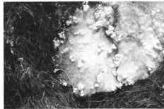
FIGURE 4 - A community of Ruppia maritima along Rude Shur, between Tehran and Qom.