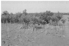
FIGURE 3 - Mangrove forest ( Avicennia marina ), near Bandare Khamir.

Other type of communities are Halostachys belangeriana communities in the Central parts of Iran (Heuze-Soltan Lake and salt flats near Mobarakieh), Kalidium caspicum communities in Semnan and Gorgan, Azerbaijan and Khorasan provinces (sometimes intermixed with Halocnemum strobilaceum and Suaeda physophora ), Atriplex verrucifera communities in NE, NW and Central parts of Iran and Arthrocnemum macrostachyum communities, a narrow zone in some mangrove communities in S. Iran.