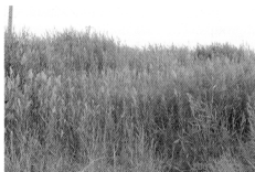
FIGURE 7 - Phragmites australis community, ca. 25 km S Delijan.