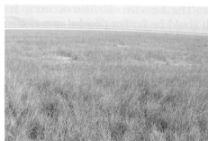
FIGURE 8 - Juncus maritimus community, Kavire Meyghan, N. Arak.

Recently Golub et al. (2001a) provided a syntaxonomical overview of class Salicornietea fruticosae . According to their proposed system, the communities of Halocnemum and Kalidium attribute to Kalidietalia caspici , Atriplex verrucifera attribute to Halimionetalia verruciferae and those of Arthrocnemum attribute to Salicornietalia fruticosae .