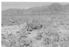
FIGURE 14 - Aeluropus littoralis comm. around Tashk Lake, Fars.

Another type of vegetation which occupies in rather similar habitats but occur in much drier climate are Reaumuria fruticosa communities. Although the species occurs sporadically in some salines in E parts of Iran, but as a community was observed in low sandy dunes developed on high salty soils at margin of great Kavir. The syntaxonomic status of this community is also not obvious at present.