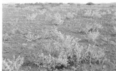
FIGURE 10 - Annual C4 halophytic communities dominated by genera Climacoptera , Bienertia , Petrosimonia and Halanthium , Mardabad near Karaj.