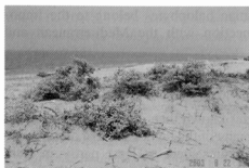
FIGURE 13 - Zygophyllum qatarense comm. along Persian Gulf coasts.