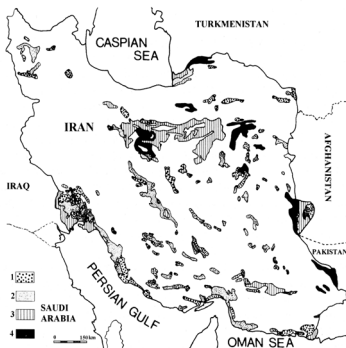
FIGURE 1 - Distribution of saline soils in Iran. 1: saline alluvial soils, 2: solonchak and solonetz soils, 3: salt marsh soils, 4: desert soils: sierozem and solonchalk soils (After Dewan & Famouri 1964, Akhani & Ghorbanli, 1993).