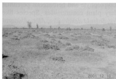
FIGURE 11 - Suaeda fruticosa community near Hasan Langi, 70 km East of Bandar Abbas.