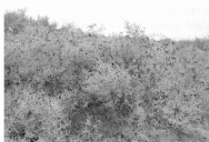
FIGURE 12 - Nitraria schoberi stand, 25 km S De-lijan.