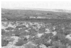
FIGURE 5 - Salicornia community in muddy hypersaline soils around Rude Shur, between Tehran and Saveh.