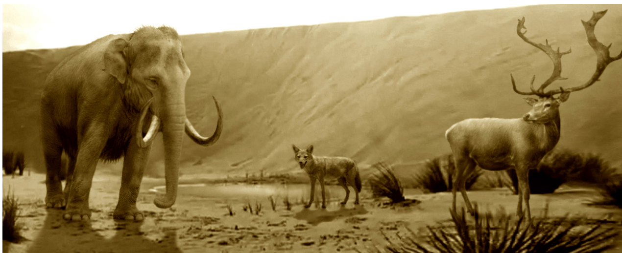
Fig. 3 - Picture of the dune landscape during the Middle-Upper Pleistocene at the Gonnesa area and vertebrate community interpreted from the track fossil record, from left to right: Mammuthus lamarmorai , Cynotherium sp. and Praemegaceros cazioti .