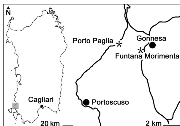
Fig. 1 - Map of the Gonnese area (Sardinia, Italy), the asterisks indicates the ichnofossil sites.

In addition, several proboscidean footprints are recently reported (Pillola and Zoboli, 2017) (Fig. 2A). These footprints have been discovered in the Funtana